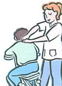
Chair massage available, by request.

but not multiple modalities like we would have in-office.