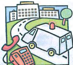
Chiropractic at your jobsite or location.

If you're an employee, just ask your co-workers and if there are enough people, ask for permission, then call us.