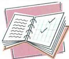
It's easy to schedule an event.

You can still be seen, even if you didn't sign up if there are still available spots. We need a minimum of 6 people.